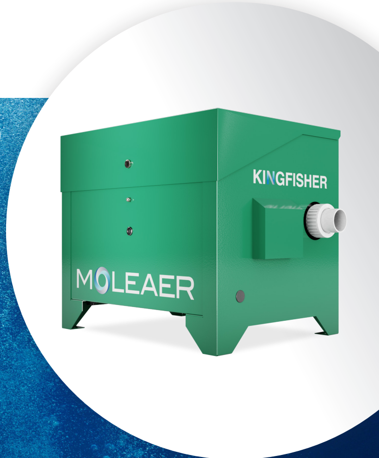
19" H x 27" L x 17" W | 55 lbs

Moleaer listened to industry experts and applied years of experience and research, including large-scale commercial water remediation projects, to develop this new, affordable nanobubble generator.